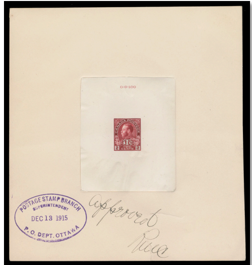
Lot 518 – Realized $53,325