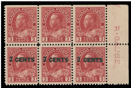
Lot 608 – Realized $23,700