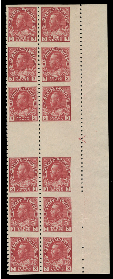
Lot 601 – Realized $171,825

Realizations below do not include the 18.5% buyer's premium.