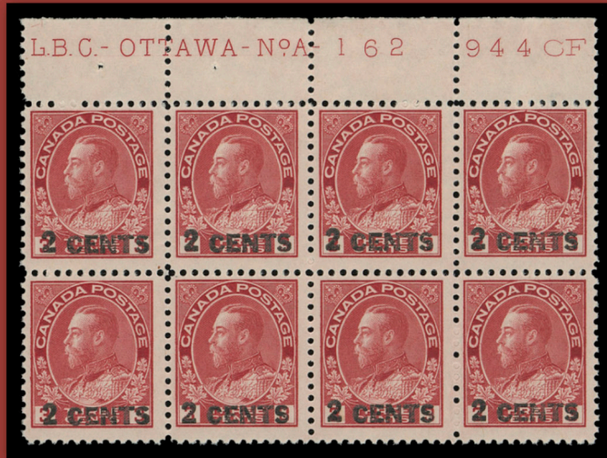
Lot 609 – Realized $38,510