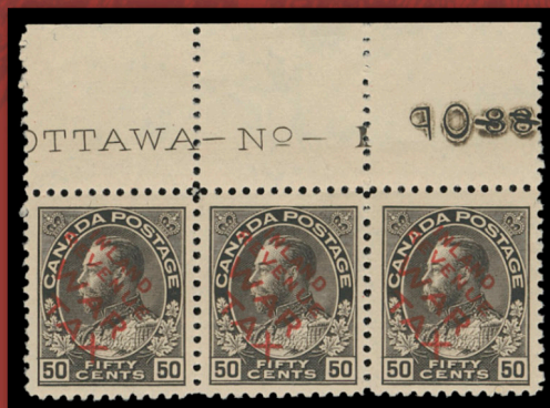
Lot 623 – Realized $13,625