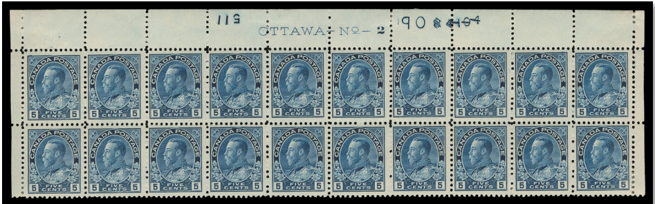
Lot 573 – Realized $21,330