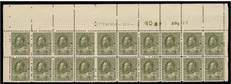
Lot 595 – Realized $23,700