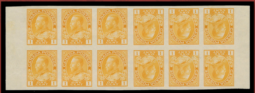
Lot 612 – Realized $59,250