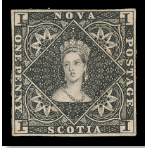
Lot 1097 – Realized $6,220

Realizations below do not include the 18.5% buyer's premium.