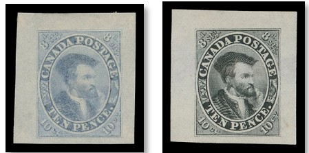
Lot 1256 – Realized $23,700