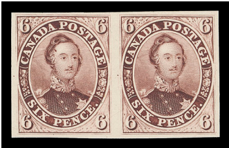
Lot 1217 – Realized $3,200