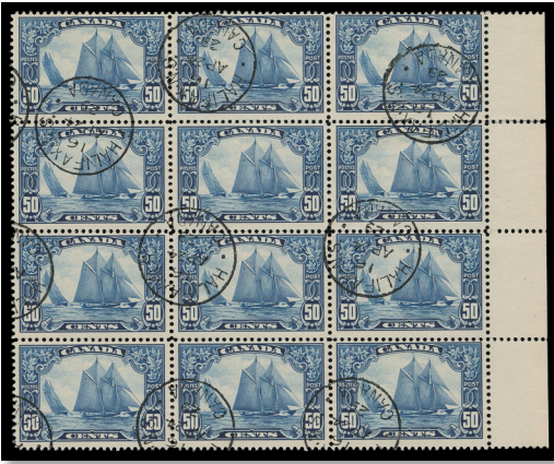
Lot 1492 – Realized $2,485