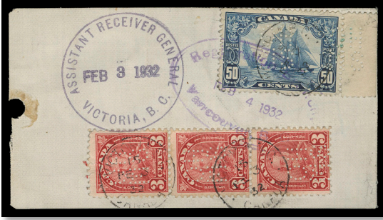
Lot 1503 – Realized $3,555

Realizations below do not include the 18.5% buyer's premium.