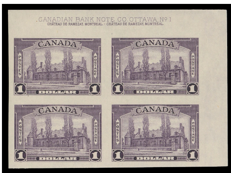
Lot 1516 – Realized $23,700