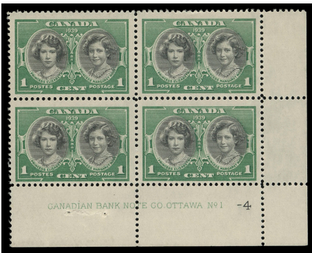
Lot 1520 – Realized $5,330