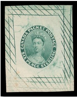
Lot 1284 – Realized $10,665