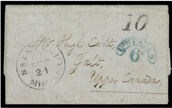
Lot 1128 – Realized $2,960