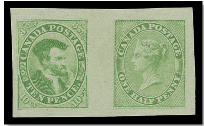
Lot 1255 – Realized $24,885