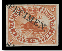
Lot 1296 – Realized $2,370