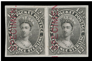
Lot 1322 – Realized $6,810