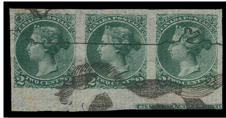
Lot 1343 – Realized $3,850