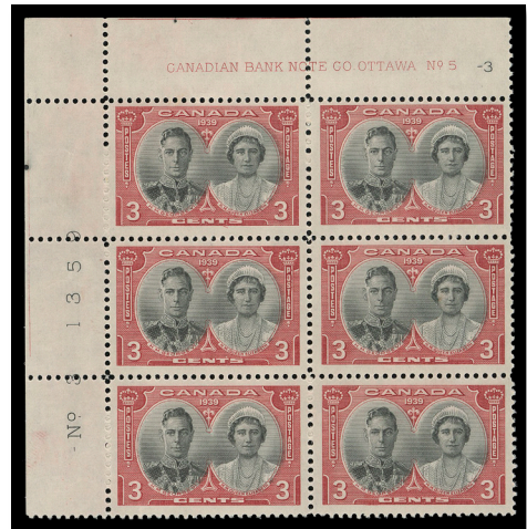
Lot 1522 – Realized $5,330