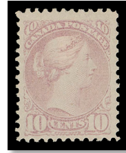
Lot 1352 – Realized $5,330