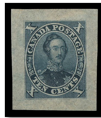
Lot 1302 – Realized $5,625