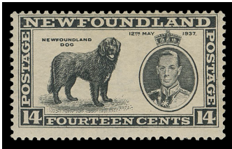
Lot 1169 – Realized $23,700