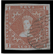
Lot 1102 – Realized $1,600