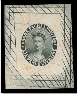
Lot 1283 – Realized $18,960

Realizations below do not include the 18.5% buyer's premium.