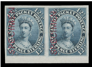
Lot 1320 – Realized $6,810