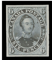
Lot 1220 – Realized $4,740