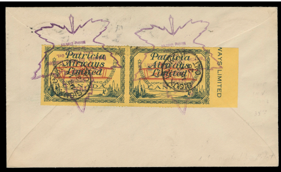
Lot 1576 – Realized $6,220