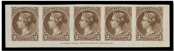
Lot 1342 – Realized $2,485