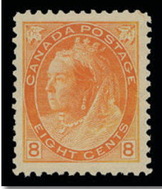
Lot 703 – Realized $1,360

Realizations below do not include the 18.5% buyer's premium.