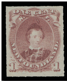
Lot 459 Realized $1,715