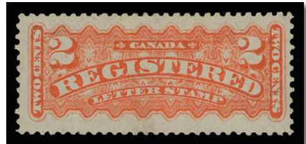
Lot 986 - Realized $860