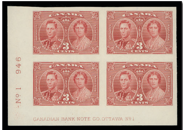
Lot 859 - Realized $5,035