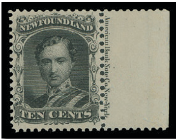
Lot 454 – Realized $1,480