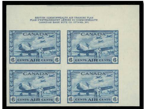
Lot 966 - Realized $5,625