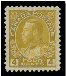
Lot 768 – Realized $415