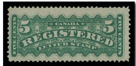
Lot 987 - Realized $1,480

Our next Public Auction is scheduled for June 13, 14, 15, 2019