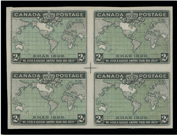
Lot 711 – Realized $3,555