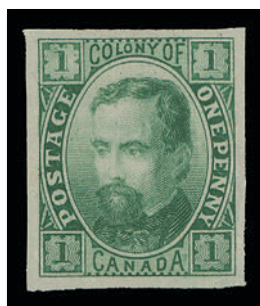
Lot 529 Realized $1,005