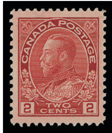
Lot 758 – Realized $305