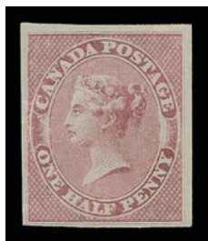
Lot 552 Realized $2,250