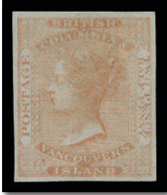
Lot 391 Realized $29,625