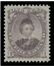
Lot 457 Realized $2,485