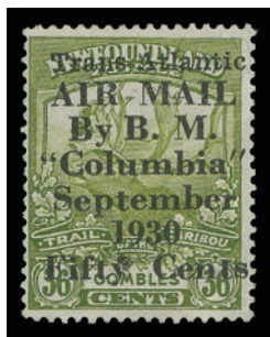
Lot 504 Realized $5,625