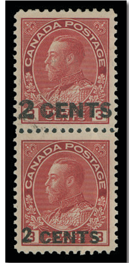
Lot 798 Realized $2,725