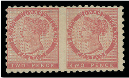
Lot 427 – Realized $7,110