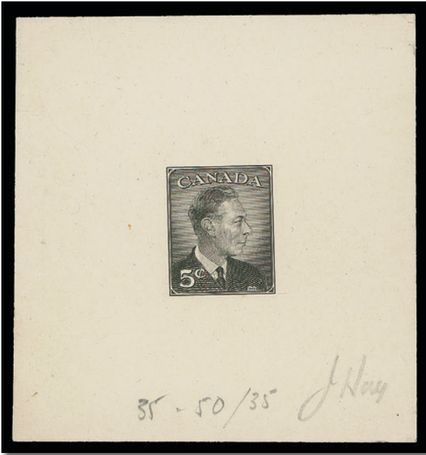
Lot 880 – Realized $1,300