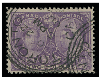
Lot 673 Realized $1,480