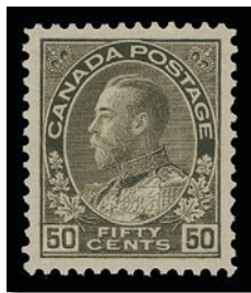
Lot 787 – Realized $530