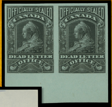
Lot 228 Realized $7,185