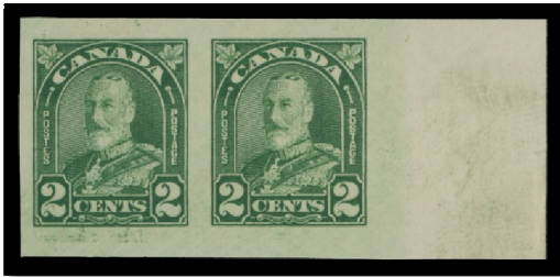
Lot 74 Realized $16,100