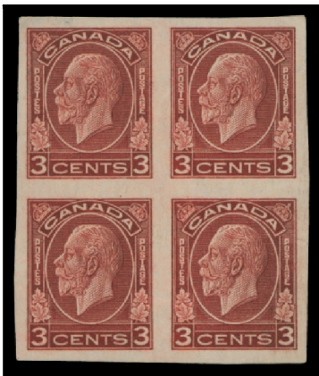
Lot 82 Realized $9,775