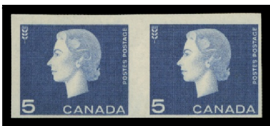
Lot 114 Realized $6,610