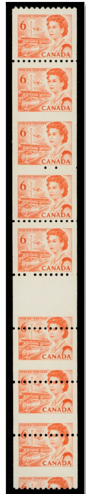
Lot 121 Realized $8,625