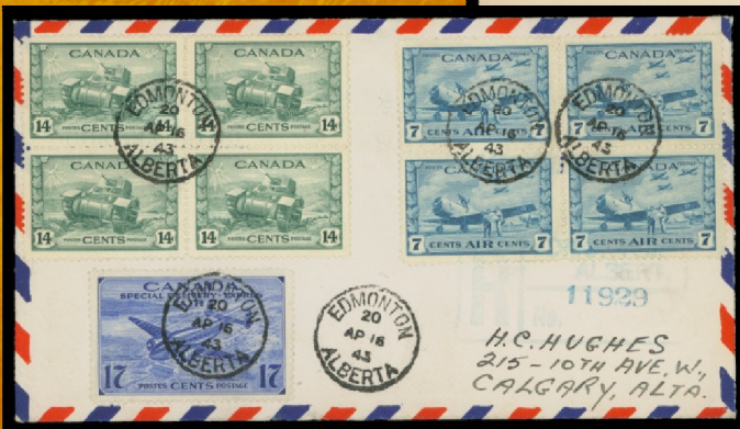
Lot 285 Realized $1,035