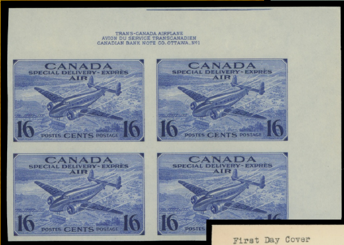
Lot 202 Realized $6,900