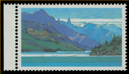
Lot 160 Realized $8,625