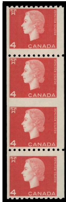
Lot 117 Realized $24,150