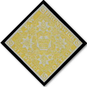
Lot 42 - Realized $9,600

Realizations below do not include the 20% buyer's premium.