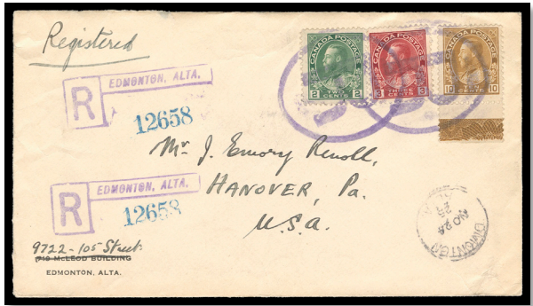
Lot 809 - Realized $66,000