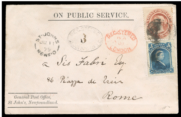
Lot 234 - Realized $10,800