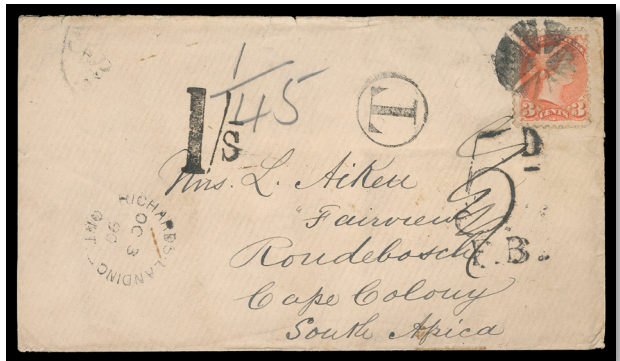
Lot 567 - Realized $4,500