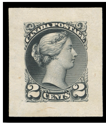
Lot 721 - Realized $57,000