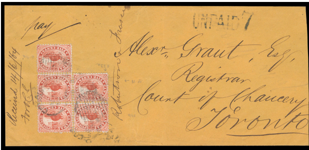
Lot 450 - Realized $4,500