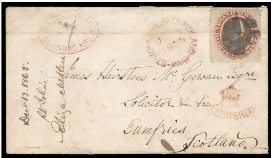
Lot 194 - Realized $3,600