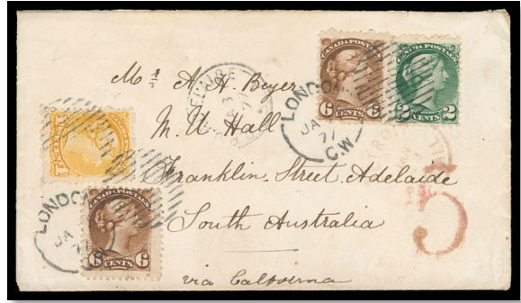
Lot 537 - Realized $14,400