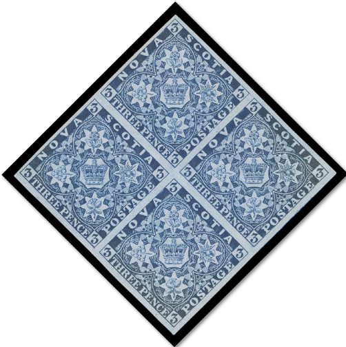
Lot 58 - Realized $9,000