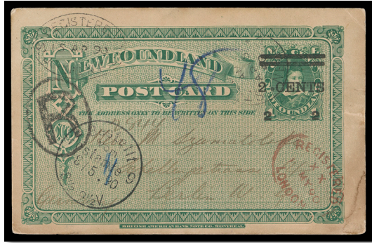
Lot 228 - Realized $2,640