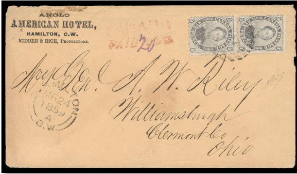
Lot 372 - Realized $19,200

Realizations below do not include the 20% buyer's premium.