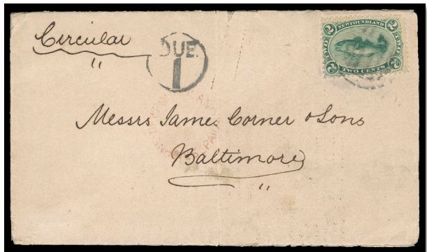
Lot 166 - Realized $1,800