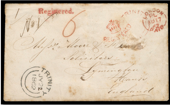
Lot 191 - Realized $4,500

Realizations below do not include the 20% buyer's premium.