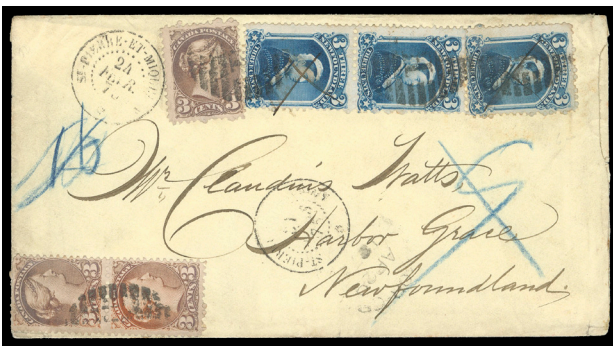
Lot 104 - Realized $11,400