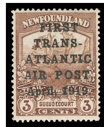
Lot 296 - Realized $30,000