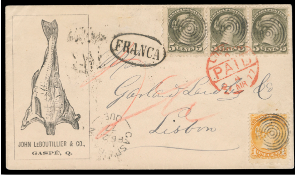
Lot 641 - Realized $54,000

Realizations below do not include the 20% buyer's premium.