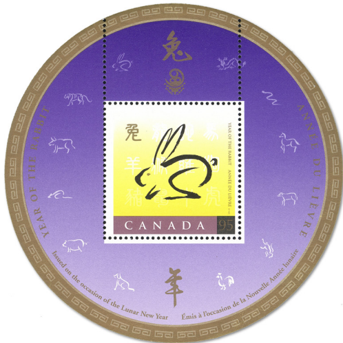
Lot 892 - Realized $5,700