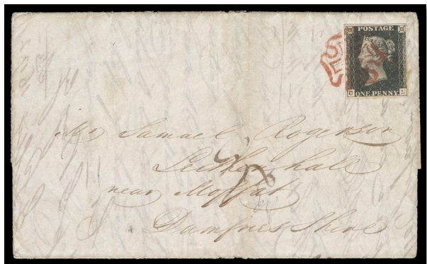
Lot 180 - Realized $3,600