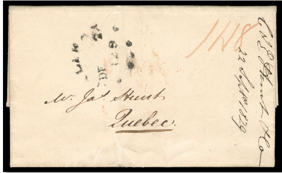
Lot 109 - Realized $4,800