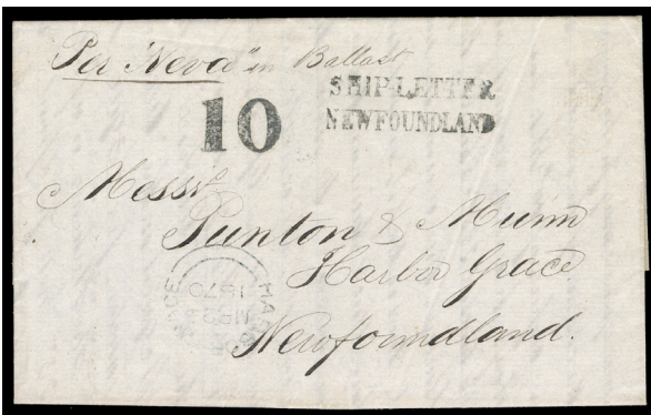
Lot 218 - Realized $8,400