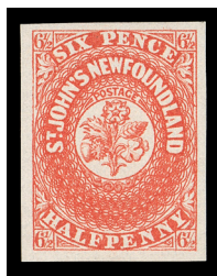
Lot 277 - Realized $6,000