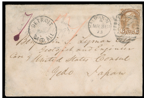
Lot 613 - Realized $20,400