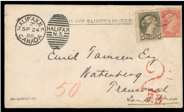
Lot 656 - Realized $6,600