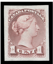
Lot 707 - Realized $11,400