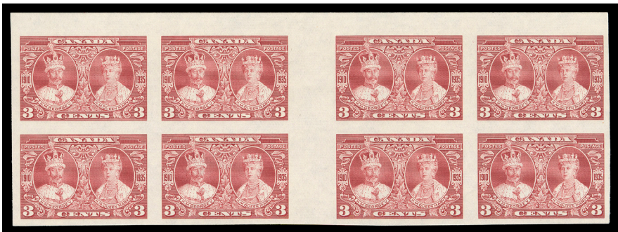
Lot 843 - Realized $5,700